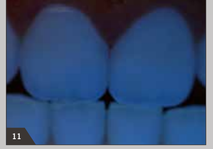
Fluorescence like with natural teeth