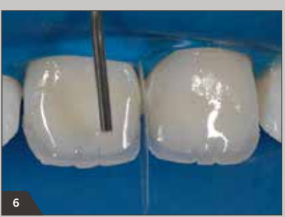
Creating mamelons with a natural appearance through light pigmentation with Amaris Flow HO

Modelling the dentine and mamelons with Amaris O1