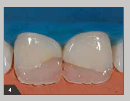
Application of Amaris TL to reconstruct the palatal enamel portion