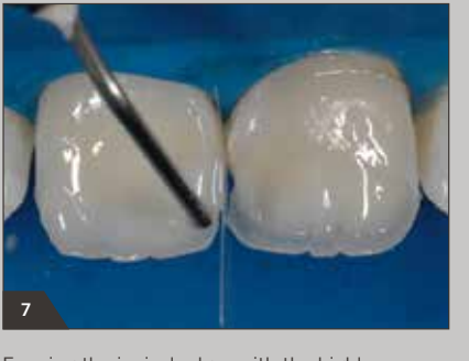
Forming the incisal edges with the highly translucent Amaris Flow HT