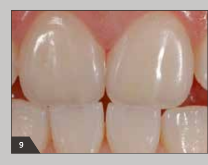
Completed anterior restoration