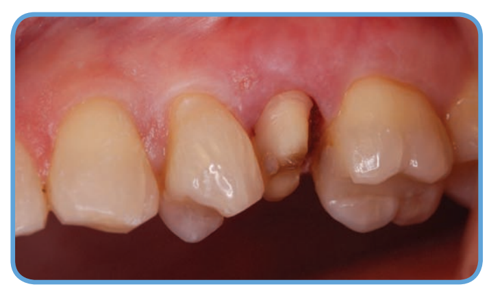
Figure 4: Tooth #13 (#25 FDI) after rinsing 3M ESPE Astringent Retraction Paste. Note that the sulcus is well retracted and dry. Margins of the crown preparation are clearly visible.

A PVS impression was taken with Imprint 3 (3M ESPE) using a quadrant triple tray. The tray was filled with Penta heavy body while Imprint 3 light body was utilized around the preparation. The impression tray was inserted and the patient was instructed to close her mouth and hold the impression in place for 5 minutes. When an impression is taken on a preparation with subgingival margins and hemoraging, the resulting impression may be compromised. Imprint 3 provided accurate details and distinct margins around the entire circumference of the crown preparation (Figure 5). Tooth #13 (#25 FDI) was temporized using Protemp Plus (3M ESPE) and cemented with Rely-X Temp NE (3M ESPE).