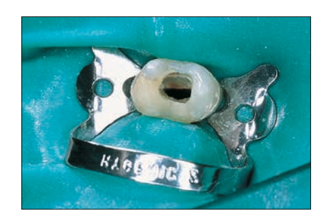
Excellent visibility and protection during root canal preparation