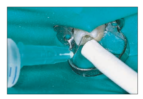
Patient optimally protected against aggressive rinsing agents