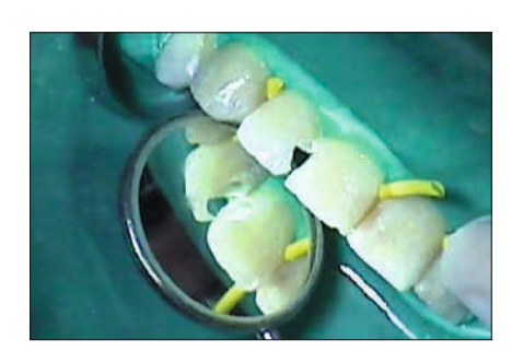
An alternative to clamps: Wedjets° stabilizing cord provide secure and gentle retention.