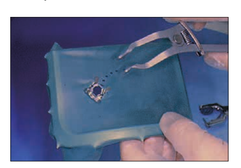
Insert winged clamp and place with clamp forceps.