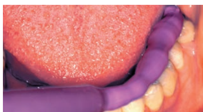
Application of OCCLUFAST ROCK (first phase)