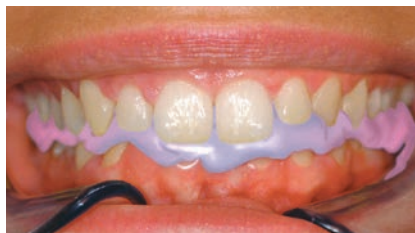
Setting phase (colour change from purple to pink)