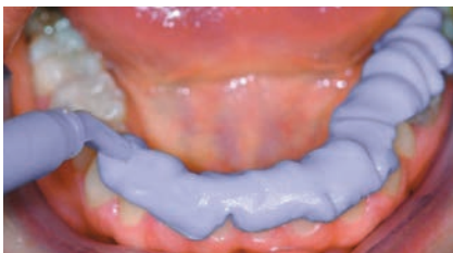
Application of COLORBITE ROCK (purple)

COLORBITE ROCK is purple at room temperature and becomes pink at 35°C in the mouth to indicate that setting is complete.