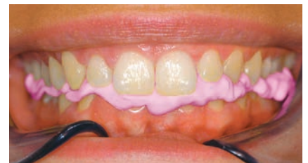
Complete colour change (pink)