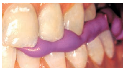
Bite registration (second phase)