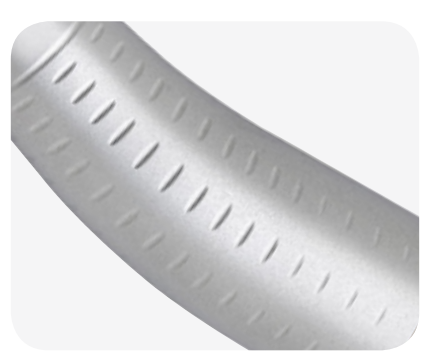
Optimised grip profile for secure grip and optimum hygiene.