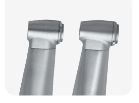
Customised production Different head sizes for optimal access options.