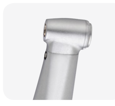
Small head Best visibility and optimal access thanks to new small head sizes.