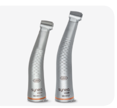
Synea Vision Short Edition The short route to better ergonomics.