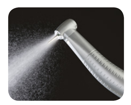
Good illumination Compact glass rod for good illumination of the treatment site.