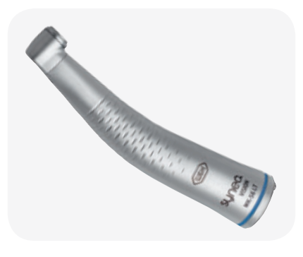
Monoblock design ergonomics cast from a single piece – for optimal hygiene.