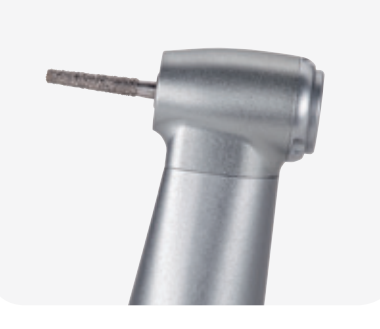
Excellent preparation results with outstandingly quiet operation and optimised head sizes.

5x spray The 5x spray ensures even cooling of the treatment site under all conditions.