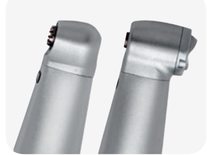
Special instruments Special reciprocating contra-angle handpieces for areas that are difficult to access.