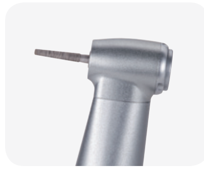
Quiet Noticeably quieter – thanks to new gearing technology.

People have Priority: To make it easier to select one of our new Synea straight and contra-angle handpieces, we listened to your requirements and have now developed two new lines perfectly suited to your needs. Synea Vision: now with innovations such as special scratch-resistant coating. and Synea Fusion: a series with top quality and maximum economy.