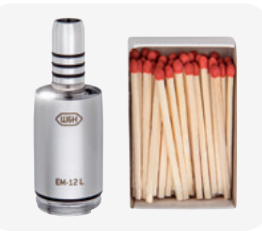
Small but what power The new micromotor EM-12 L with LED for bright as daylight illumination of the treatment area.