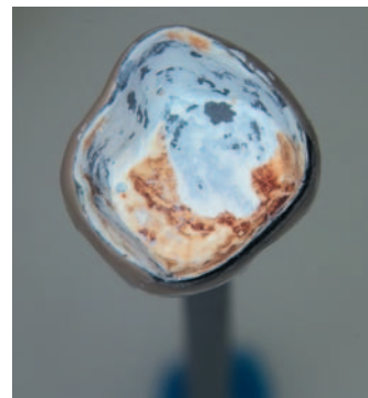
The particularly thin film of the polycarboxylate cement can be seen clearly

cements, though this does worsen setting of the material so that loosening can occur. Adequate relative drying is therefore advised. On setting, the polycarboxylate cements form a salt with a solubility classified at about the level of zinc phosphate cement 3 . Depending on the powder/liquid ratio, polycarboxylate cements are more bacteria-proof and firmer than zinc phosphate cement so they are superior to all previous temporary cements in these properties. Thus, the great disadvantage of the high solubility of previous zinc oxide-eugenol cements 2 is no longer present in tempolink® single and multi. In my observation period, the material is also suitable for longer-term, semi-permanent fitting of crowns and especially bridges, when adequate mechanical retention is present.