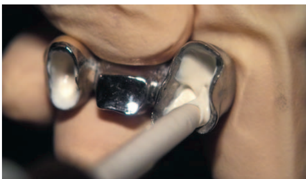
Easy application of the cement layer without mixing

The first time it is used, the ease of handling the double syringe with mixing cannula comes as a surprise. The polycarboxylate-based material can be injected directly into the crowns without elaborate mixing on a separate mixing block. The two components can be squeezed easily through the mini mixing cannula with little force. The material can be applied quickly with the cannula tip evenly over the insi-