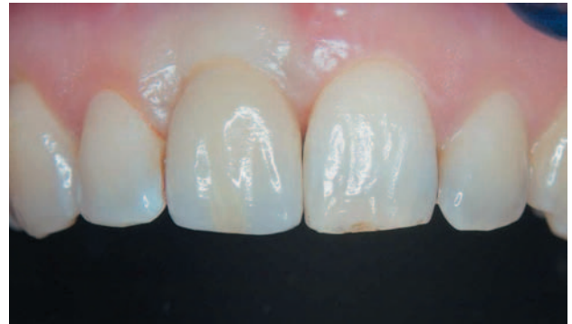
A temporary all-ceramic crown fitted with tempolink® clear

new temporary cements is highly suitable for securing all dental crown and bridge restorations. The different versions of DETAX tempolink® can cover nearly all the possible indications and have obvious advantages for dentist and patient as described above.