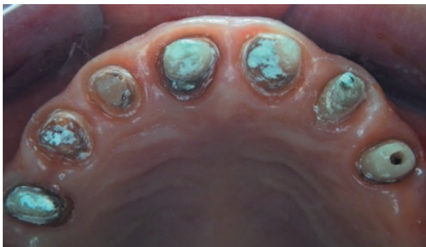
No inflammation after 3 months with tempolink® multi

de of the crown and at the same time be spread thinly. This is done so quickly, without having to stop and pick up fresh material from the mixing block, that the dentist or dental nurse can work stress-free without extra assistance even in patients with a lot of saliva. tempolink® comes in two polycarboxylate versions – “single” as a fast-setting component and “multi” as a more slowly setting component for more complex restorations. The high viscosity of the material ensures that the temporary crowns can be pushed smoothly