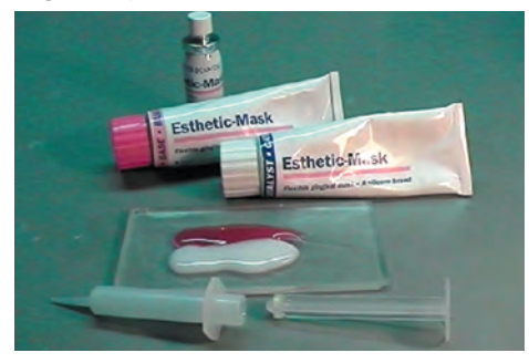
Fig. 4: Material ready for mixing

The material is syringed into the labial inlet until it exudes from the oral outlet (Fig. 5).