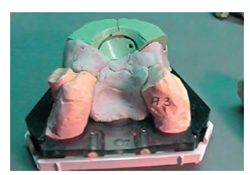
Fig. 2: Sealed model

The segment of impression is put on the model and sealed with a permanently elastic material to the model base (Fig. 2).