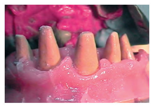
Fig. 6: Surface

Even very fine details right up to the base of the model system have been reproduced (Fig. 7).