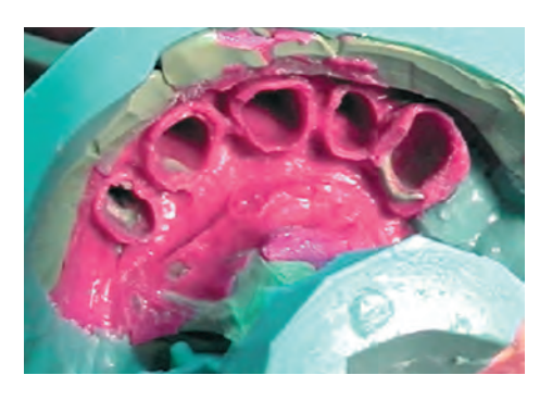
Fig. 3: 2-phase overcast

Sealing is required to build up counter pressure during subsequent filling using the syringe supplied. Two equal lengths of material (Fig. 4) are mixed together and inserted into the syringe with the mixing spatula.