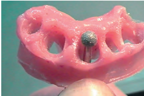
Fig. 8: Trimming

Esthetic Mask is easily trimmed using a new, large round diamond ISO 030 - 040 (Fig. 8).