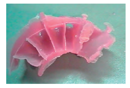
Fig. 7: Details

Even very fine details right up to the base of the model system have been reproduced (Fig. 7).