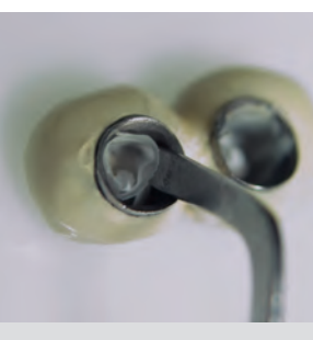
Easy-to-remove cement residues

If the reconstruction has been removed for inspection or for other purposes, the cement residues can be extracted almost in whole pieces. After brief disinfection, the reconstruction can be fixed again immediately with the minimum of effort. Until long-term experience has been gathered with this fixati-