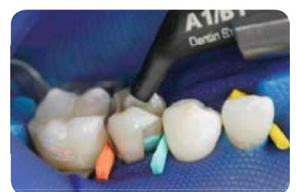
Fig. 14: Application of the Synergy D6 dentin material.