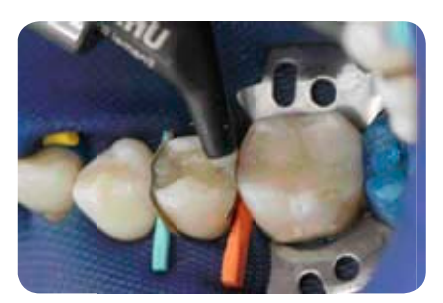
Fig. 21: Application of the Synergy D6 enamel material.