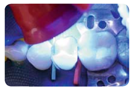
Fig. 16: Polymerisation of the first increments for 20 s.