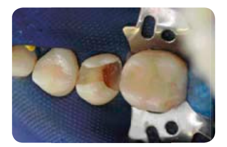
Fig. 5: View of secondary caries.