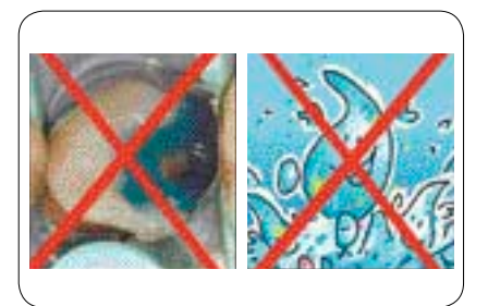
Fig. A: Technique sensitive steps such as rinsing and subsequent drying which may lead to postoperative sensitivity, are not required. Etch with phosphoric acid or clean using pumice stone only in cases with unprepared enamel.

In the following clinical case, One Coat 7.0 self-etching adhesive was used, in which no initial etching of the enamel and dentin using phosphoric acid was required (Fig. A). Synergy D6 was used as the restorative composite material together with One Coat 7.0 from Coltène/Whaledent. The consistency of this composite is very wellsuited for modelling complex anatomical occlusal surfaces. The sculpted contours are retained due to its nonslumping, non-sticky consistency until light curing has been performed. This restorative material adapts itself very well against the margins of the cavity. One Coat 7.0 guarantees a durable bond. Shade selection is very easy thanks to Duo Shades which enable accurate self-blending visualization for very esthetic, undetectable results. The self-blending Synergy D6 Duo Shades were created by grouping