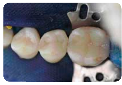
Fig. 28: Situation after gross preparation.