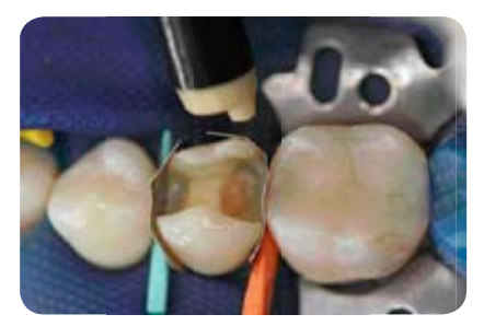
Fig. 11: Gentle air stream of excess bond.