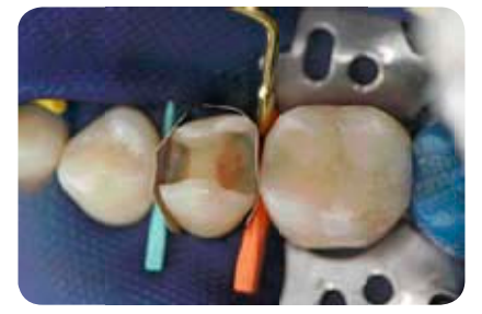
Fig. 8: Application of customised non-elastic matrix bands from roeko using the anatomical placement instrument from Coltène/Whaledent.