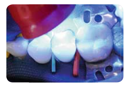
Fig. 20: Polymerisation of the third layer.