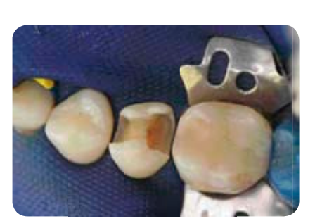
Fig. 7: Cavity after excavation of caries.