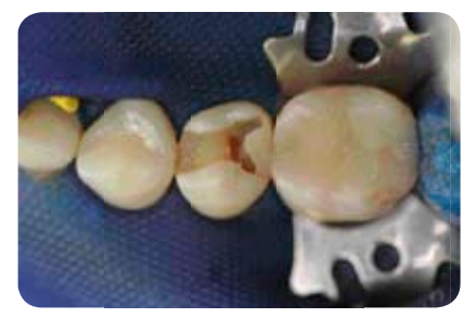
Fig. 4: Partial removal of the old restoration.