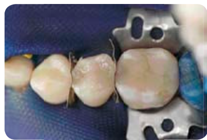
Fig. 26: Opening of the matrices.