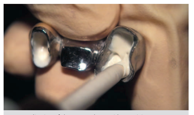
Easy application of the cement layer without mixing

The first time it is used, the ease of handling the double syringe with mixing cannula comes as a surprise. The polycarboxylate-based material can be injected directly into the crowns without elaborate mixing on a separate mixing block. The two components can be squeezed easily through the mini mixing cannula with little force. The material can be applied quickly with the cannula tip evenly over the insi-