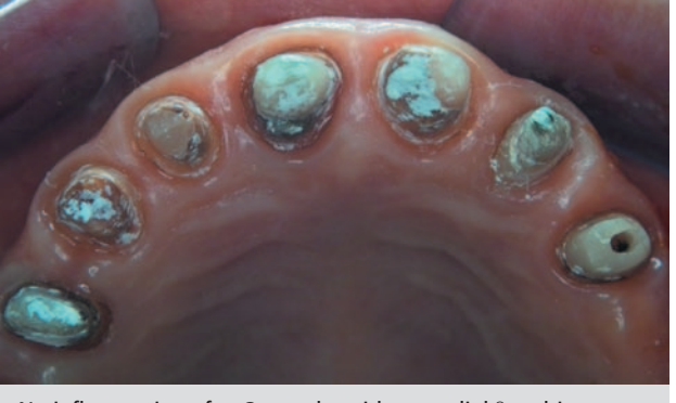
No inflammation after 3 months with tempolink® multi

de of the crown and at the same time be spread thinly. This is done so quickly, without having to stop and pick up fresh material from the mixing block, that the dentist or dental nurse can work stress-free without extra assistance even in patients with a lot of saliva. tempolink<sup>®</sup> comes in two polycarboxylate versions – "single" as a fast-setting component and "multi" as a more slowly setting component for more complex restorations. The high viscosity of the material ensures that the temporary crowns can be pushed smoothly