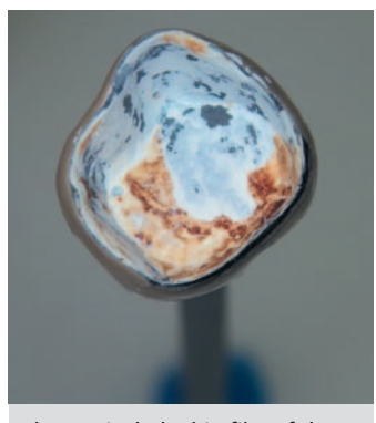
The particularly thin film of the polycarboxylate cement can be seen clearly

mer than zinc phosphate cement so they are superior to all previous temporary cements in these properties. Thus, the great disadvantage of the high solubility of previous zinc oxideeugenol cements<sup>2</sup> is no longer present in tempolink<sup>®</sup> single and multi. In my observation period, the material is also suitable for longer-term, semi-permanent fitting